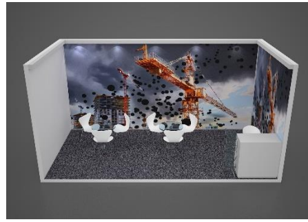
2 x WALL BRANDING