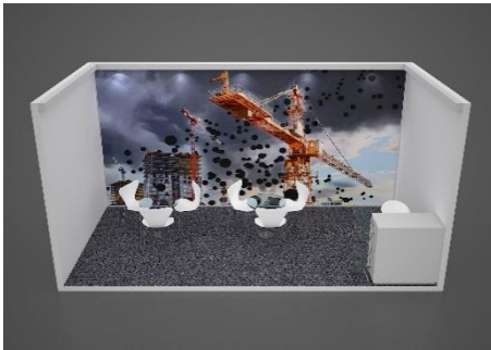
1 x WALL BRANDING