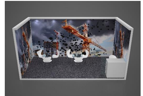
3 x WALL BRANDING